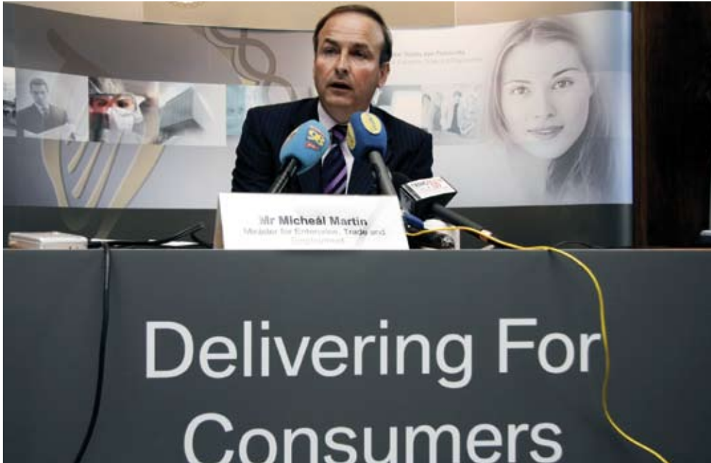
Micheál Martin TD, Minister for Enterprise, Trade and Employment at the Announcement of the new Consumer Bill.

new regulatory environment. Since the removal of the Order, the Authority has received no complaints of anti-competitive behaviour in the sector, nor has it seen any evidence of such behaviour. The Authority's monitoring of the sector is ongoing and it intends to publish, later in 2007, an analysis of developments in the grocery sector focusing on pricing trends, market structure and barriers to entry.