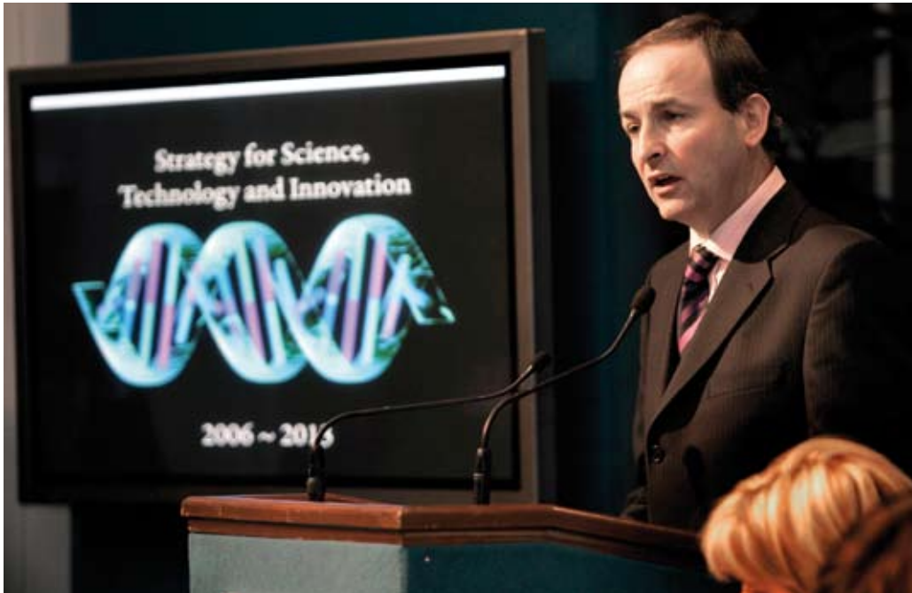
Micheál Martin TD, Minister for Enterprise, Trade and Employment at the launch of the New Strategy for Science, Technology & innovation, 2006 - 2013.

companies on sub-contracting R&D work to unconnected parties will now qualify under the tax credit scheme up to a limit of 10 per cent of qualifying R&D expenditure in any one year. This is in addition to the existing provision in the scheme in relation to subcontracting to universities.