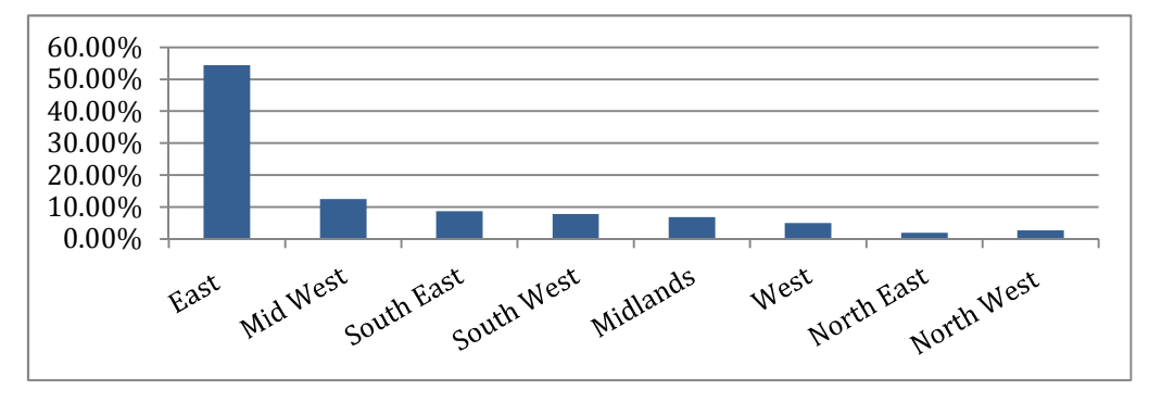
Figure 2 Percentage of CGS Lending Sanctioned by Region (Monetary Value)